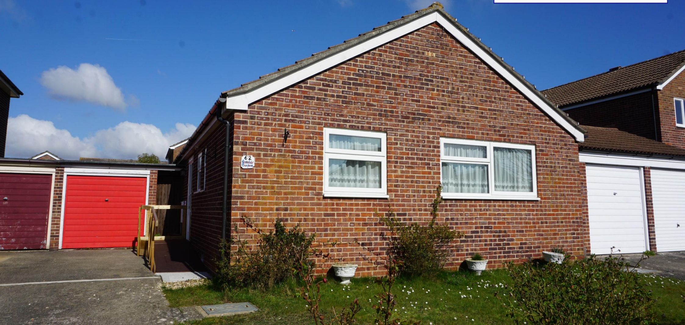
62 Rosedale Gardens Thatcham Berkshire RG19 3LF